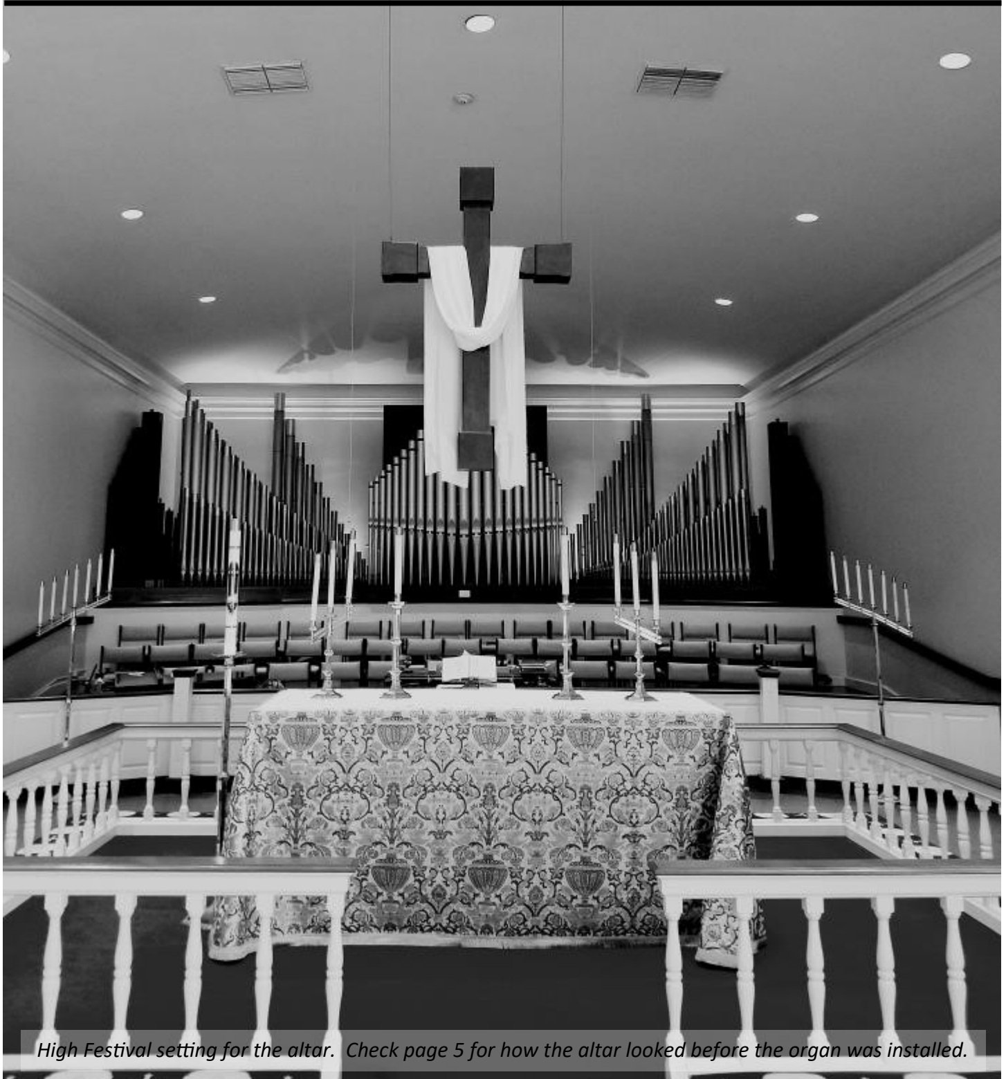
High Festival setting for the altar. Check page 5 for how the altar looked before the organ was installed.