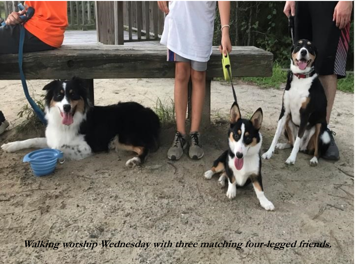
Walking worship Wednesday with three matching four-legged friends.